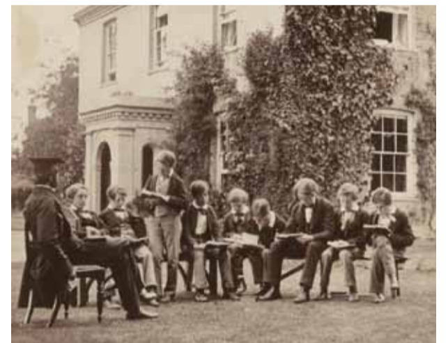
A photograph of Twyford School taken by Charles Dodgson in 1858