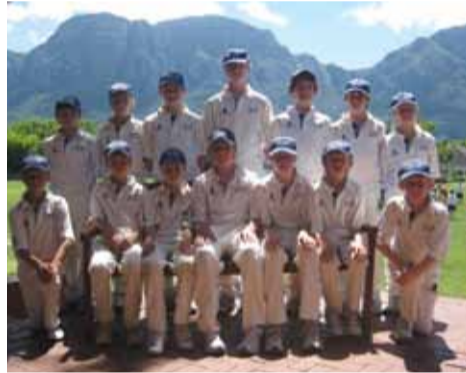
Twyford Tour Team in Cape Town

Meanwhile, Twyford now boasts 25 boys and 5 girls playing cricket for the District, eight of whom also play for Hampshire at varying age levels. Unsurprisingly, this translated to strong performances across the age groups. Of 108 matches played, 68 were won, 13 drawn and only 27 lost. Most notably, the Colts beat Ludgrove in the final of the Marlborough 6-a Side competition, and also finished as runners-up in the English Schools Cricket Association National Final. Later at Autumn half term, fourteen boys and two staff embarked on a memorable cricket tour to South Africa. On the field, the boys won five out of eight games, but the most vivid memories will be from the time spent visiting townships, Robben Island and the National Parks.