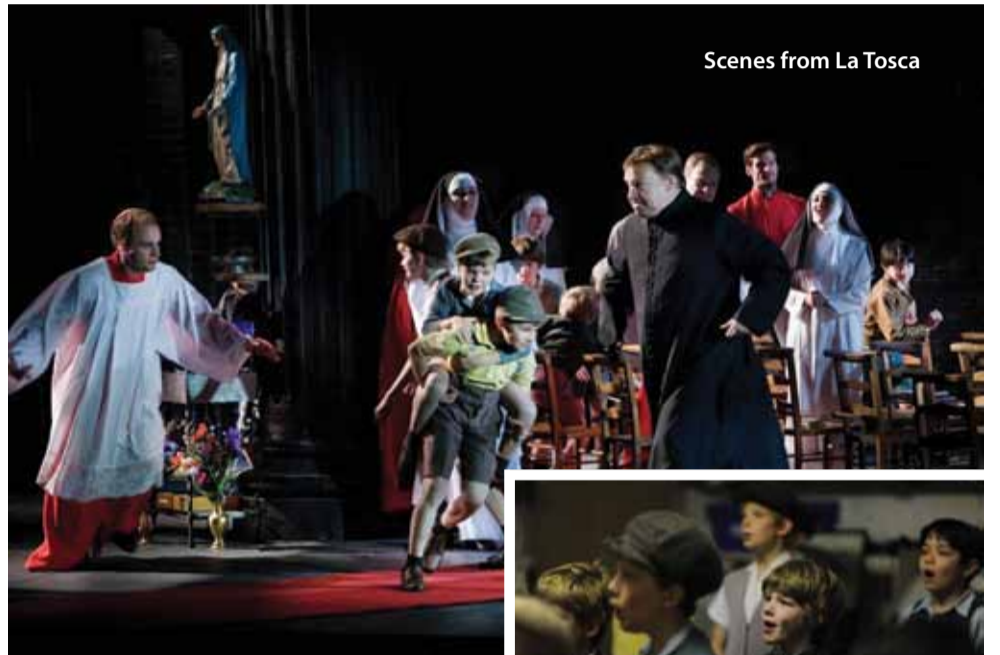
Scenes from La Tosca

2010 was the year of Verdi's Tosca . Fifteen of our trebles were chosen to perform for ten nights at The Grange. We have now established a firm link with Grange Park Opera who have invited us to be involved in a further production in 2012.