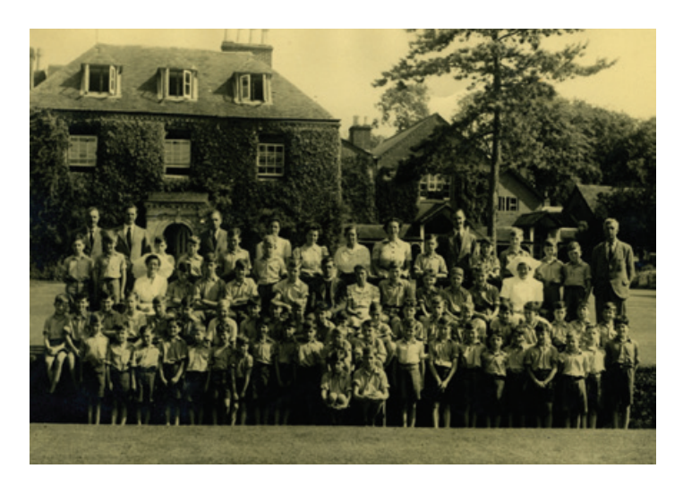
TWYFORD SCHOOL PHOTO, SUMMER 1945