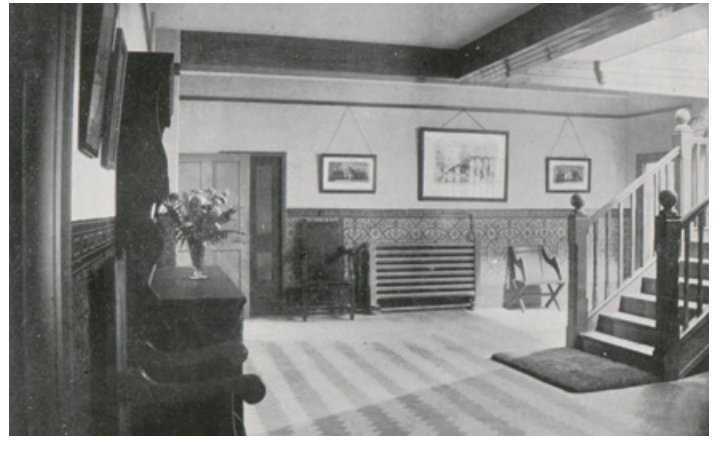
THE SCHOOL HALL AND STAIRCASE

The physical changes that took place at Twyford in that year are notable in that they form the epicentre of our daily life at Twyford today. Central Hall was created. It had been a dark, cramped and ill ventilated area containing the boot rooms and washroom. These were cleared away, the staircase installed, lit by new skylights and the high windows above. Serle's Hill was built as a sanatorium - we know the buildings better today as Pre-Prep – but it was never used for purpose as deemed too big and let instead as a private residence.