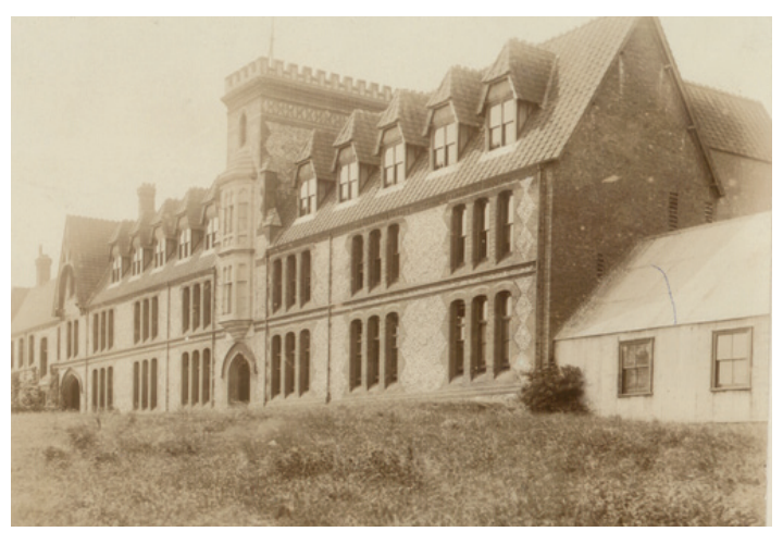
WESTFIELDS SCHOOL, WINCHESTER

Serle's Hill remained in residential use until September 1985 when it opened as the Pre-Prep with two classes of boys and girls and two teachers.