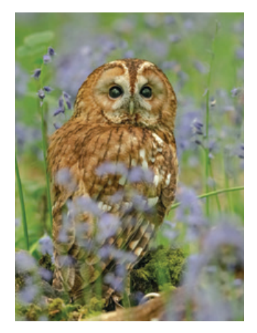
TAWNY OWL BY STEVE BAILEY

Back in the 1990s, Microsoft used the slogan: 'Where do you want to go today?' The implication was that you could go anywhere (with Microsoft). I would urge children to have ambitions beyond the