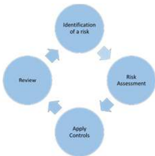
Figure 2 – Risk Assessment Cycle

It is important to have a regular cycle of review, with appropriate processes to support. The cycle is fundamental to delivering safe working environments and is shown graphically at Figure 2.