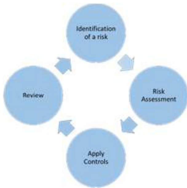
Figure 2 – Risk Assessment Cycle

It is important to have a regular cycle of review, with appropriate processes to support. The cycle is fundamental to delivering safe working environments and is shown graphically at Figure 2.